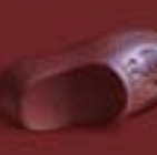
CLOG SWEETS Weight : ±0.32oz (9 g) 24 pieces per plate Number of plates : 5 Parcel Nr 133 Ref : MLD-090217-M00