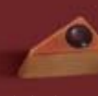
TRIANGLES Weight : ±0.3oz (8 g) 36 pieces per plate Number of plates : 5 Parcel Nr 71 Ref : MLD-090137-M00