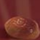
WALNUTS Weight : ±0.4oz (11 g) 32 pieces per plate Number of plates : 5 Parcel Nr 23 Ref : MLD-090071-M00