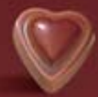
SMALL HEARTS Weight : ±0.4oz (11 g) 24 pieces per plate Number of plates : 5 Parcel Nr 4 Ref : MLD-090047-M00