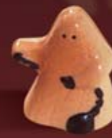
7 CM GHOST Height : 2 2 / 3 in. (7 cm) Weight : ±1.05oz (30 g) 4 complete ghosts per plate Number of plates : 3 Parcel Nr 112 Ref : MLD-090184-M00