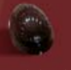
STRIPED SMALL EGGS Weight : ±0.35oz (10 g) 36 half-eggs per plate Number of plates : 10 Parcel Nr 5 Ref : MLD-090048-M00