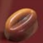
COFFEE BEANS Weight : ±0.32oz (9 g) 36 pieces per plate Number of plates : 5 Parcel Nr 77 Ref : MLD-090142-M00