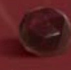
DIAMONDS Weight : ±0.4oz (11 g) 28 pieces per plate Number of plates : 5 Parcel Nr 29 Ref : MLD-090081-M00