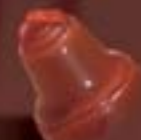
BELLS Weight : ±0.35oz (10 g) 28 pieces per plate Number of plates : 3 Parcel Nr 81 Ref : MLD-090148-M00