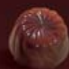
STRIPED ROUND SWEETS Weight : ±0.35oz (10 g) 32 pieces per plate Number of plates : 5 Parcel Nr 9 Ref : MLD-090052-M00