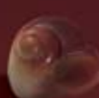
SNAILS Weight : ±0.35oz (10 g) 35 pieces per plate Number of plates : 5 Parcel Nr 64 Ref : MLD-090130-M00