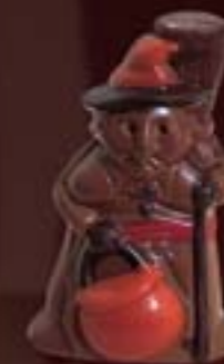
WITCH Height : 4 1 / 3 in. (11 cm) Weight : ±2oz (60 g) 2 complete witches per plate Number of plates : 3 Parcel Nr 125 Ref : MLD-090204-M00

Halloween decoration – 5 subjects: 1 witch, 2 ghosts, 1 bat, 1 pumpkin 20 subjects per plate. 2 plates Weight : ±0.35oz (10 g) Number of plates : 5 Parcel Nr 108 Ref : MLD-090179H-M00