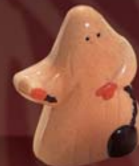
11 CM GHOST Height : 4 1 / 3 in. (11 cm) Weight : ±2.68oz (75 g) 1 complete ghost per plate Number of plates : 3 Parcel Nr 113 Ref : MLD-090185-M00