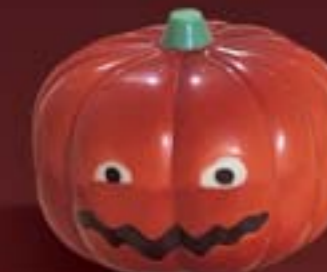
PUMPKIN Size : 3 1 / 2 in. x Ø 4 3 / 4 in. (9 x Ø 12 cm) Weight : ±5.25oz (150 g) 1 pumpkin per plate Number of plates : 2 Parcel Nr 89 Ref : MLD-090157-M00