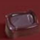
SOUTHERN STAR Weight : ± 11 g 24 pieces per plate Number of plates : 5 Parcel Nr 123 Ref : MLD-090202-M00