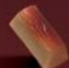
TWIGS Weight : ±0.4oz (11 g) 27 pieces per plate Number of plates : 5 Parcel Nr 10 Ref : MLD-090053-M00