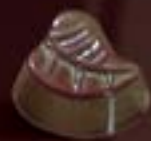
ORANGE TREE LEAVES Weight : ±0.4oz (11 g) 30 pieces per plate Number of plates : 5 Parcel Nr 7 Ref : MLD-090050-M00