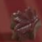
MAPLE TREE LEAVES Weight : ±0.4oz (11 g) 30 pieces per plate Number of plates : 5 Parcel Nr 16 Ref : MLD-090059-M00