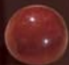
HALF-SPHERES Weight : ±0.32oz (9 g) 28 pieces per plaque Number of plates : 5 Parcel Nr 69 Ref : MLD-090135-M00