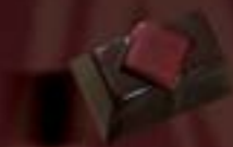
TOPAZES Weight : ±0.4oz (11 g) 36 pieces per plate Number of plates : 5 Parcel Nr 47 Ref : MLD-090107-M00