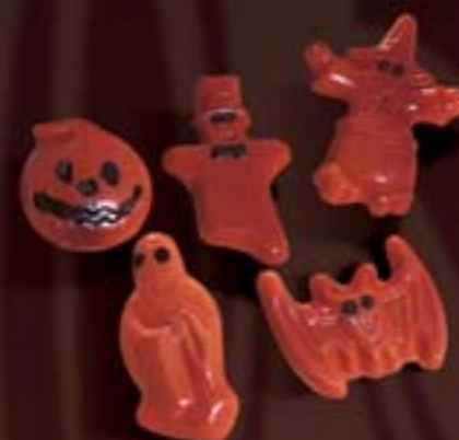
HALLOWEEN SET Pumpkin pieces : 2 plates. 20 full pieces per plate Weight : ±0.35oz (10 g) Pumpkin bouchees/chocolates : 12 full bouchees per plate Weight : ±0.4oz (11 g), with filling : ±1.2oz (35 g)

Halloween decoration – 5 subjects: 1 witch, 2 ghosts, 1 bat, 1 pumpkin 20 subjects per plate. 2 plates Weight : ±0.35oz (10 g) Number of plates : 5 Parcel Nr 108 Ref : MLD-090179H-M00