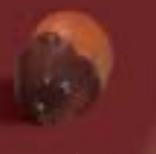
HAZELNUTS Weight : ±0.4oz (11 g) 32 pieces per plate Number of plates : 5 Parcel Nr 36 Ref : MLD-090092-M00